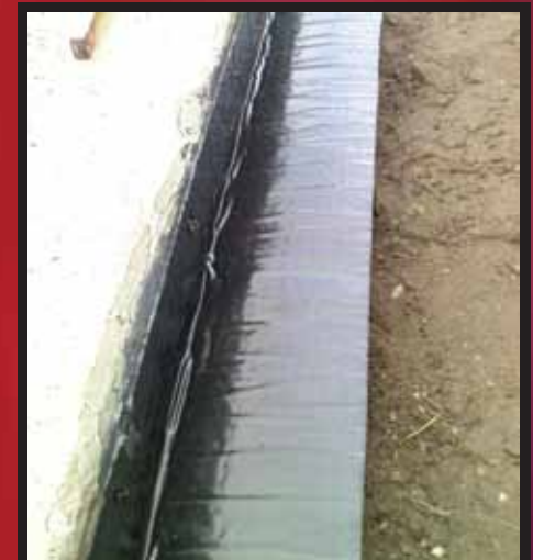
Installing Ura-Fen Shield into Cavity