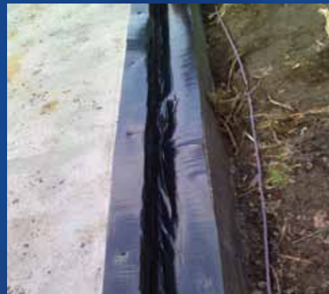
Ura-Fen Shield Top Laded Perimeter