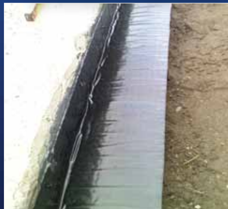
Ura-Fen Shield Slide Load Cavity Perimeter