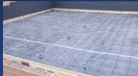
Ura-Fen Shield Full Under-slab Termite and vapour barrier

Ura-Fen shield when installed as part of a cavity perimeter system, or as full under-slab termite and vapour barrier requires no costly re-treatments.